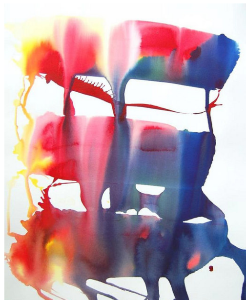
David French: Chromatic Payoff, untitled, oil on canvas